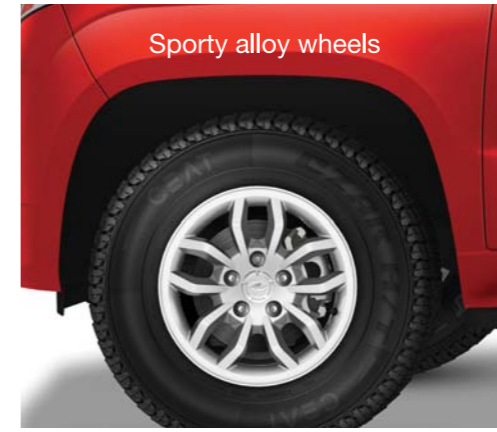
Sporty alloy wheels