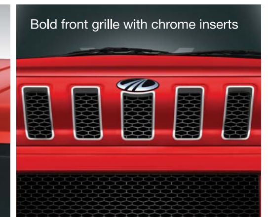
Bold front grille with chrome inserts