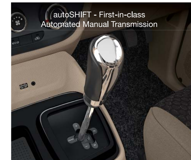
autoSHIFT - First-in-class Automated Manual Transmission