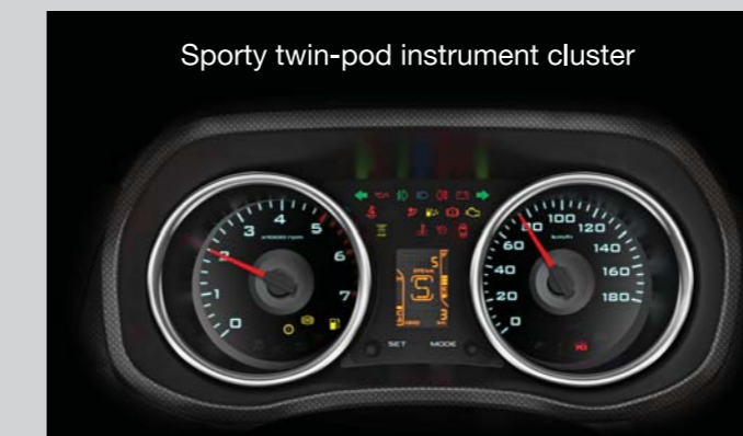
Sporty twin-pod instrument cluster