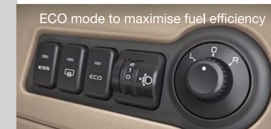
ECO mode to maximise fuel efficiency

mHawk 80 - 1.5 litre diesel engine with a 2-stage turbocharger