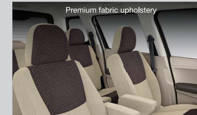
Premium fabric upholstery