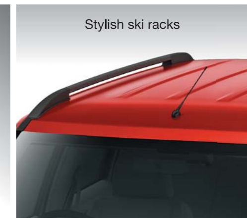
Stylish ski racks