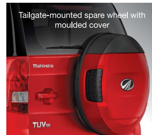
Tailgate-mounted spare wheel with moulded cover